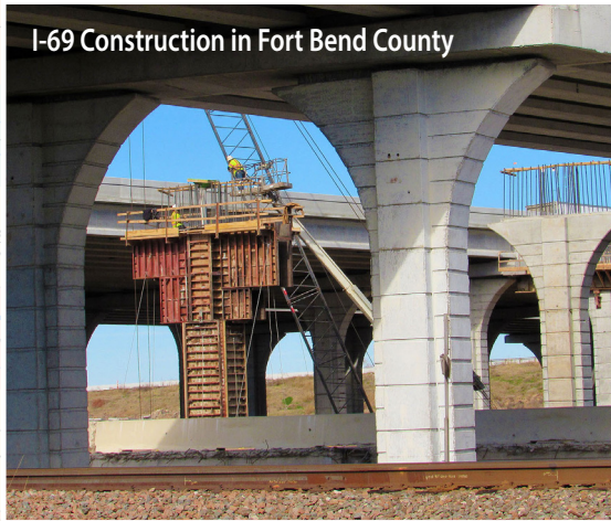
I-69 Construction in Fort Bend County