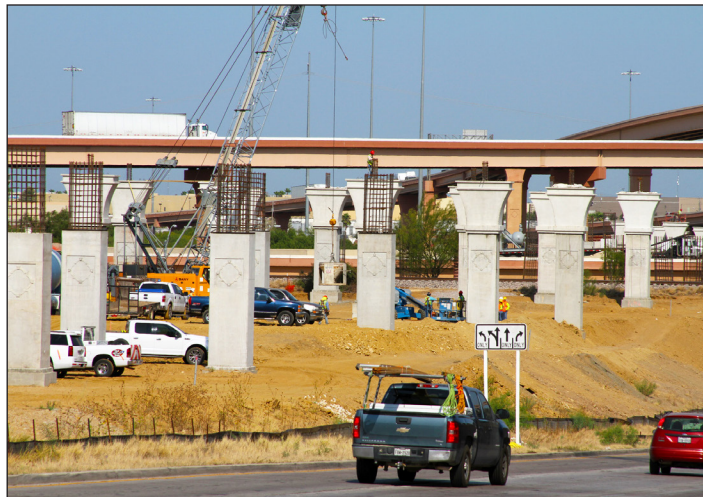
Construction of new I-69 mainlanes at I-35 interchange in Laredo

Signing Unconnected Segments: Amend the provision in MAP-21 that allows segments to be added to the Interstate Highway System if they are at standard and there is a plan to connect to the Interstate System within 25 years of enactment of MAP-21 (2012). When the interstate system was initially developed, completed segments were signed as interstate regardless if they connected to an existing interstate. Removing the requirement of demonstrating connection by 2037 (25 years after enactment of MAP-21 in 2012), would be consistent with how the system was initially developed and would encourage more