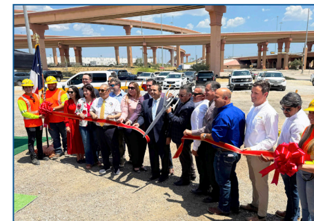
Ribbon cutting at completion of two I-69W direct connect bridges at I-35 in Laredo.