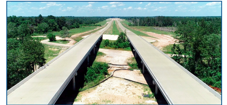
8-mile-long I-69 Diboll Relief Route south of Lufkin to be completed in the fall of 2025.

The Alliance for I-69 Texas has a simple mission: Aggressively press for development of projects that will ultimately lead to the completion of I-69 in Texas. Established in 1994, the Alliance is a non-profit made up of cities, counties, port authorities, economic development organizations and associate members.