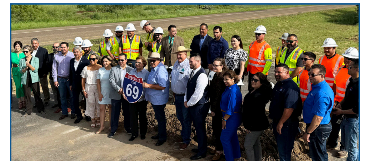
Kickoff of a series of projects to extend I-69 across Kenedy County ranchlands in South Texas.