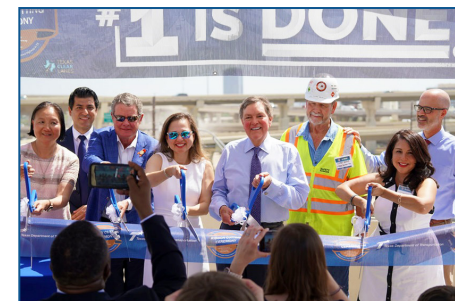
Celebration for the completion of the $259 million I-69/Loop 610 interchange expansion in Houston.