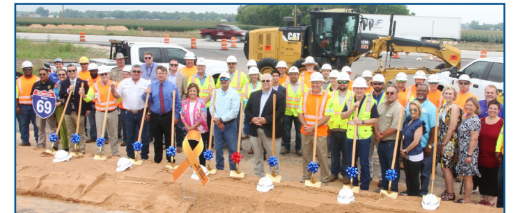
2024 Groundbreaking ceremony for 8-mile I-69 Wharton Relief Route.